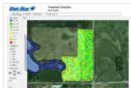
Application Rate Map