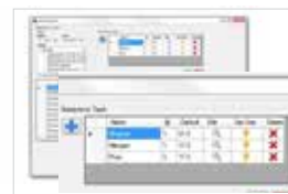
Setting Nutrient Value